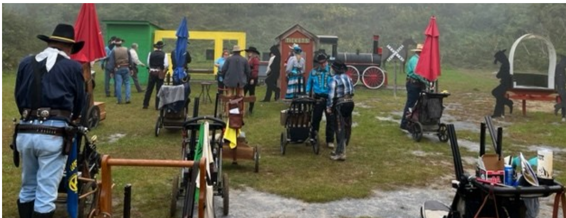
Rukus 2022—Early Sunday morning—Getting ready to start the day