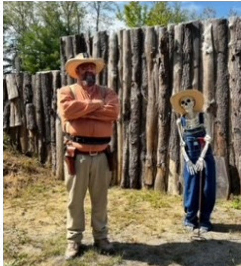
Rukus 2022 All cowboys out on the range...